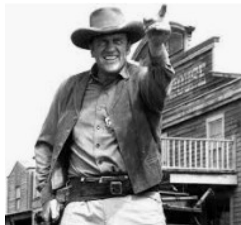
James Arness as Matt Dillon

Bridge Over Troubles Water - Simon and Garfunkel (They Long to Be) Close to You - The Carpenters American Woman/No Sugar Tonight - The Guess Who Raindrops Keep Falling on My Head - B.J. Thomas War - Edwin Starr American Woman/No Sugar Tonight - The Guess Who Ain't No Mountain High Enough - Diana Ross I'll Be There - The Jackson 5 Get Ready - Rare Earth