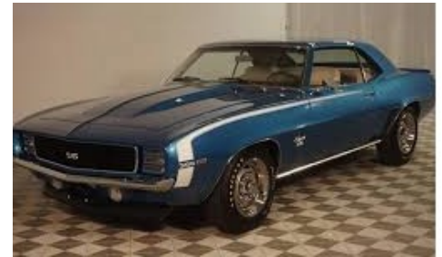
Muscle car Chevy Camaro