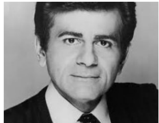
Casey Kasem's radio show rules the airwaves