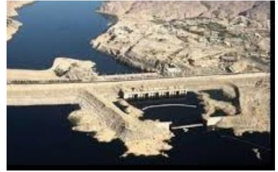
The Aswan Dam