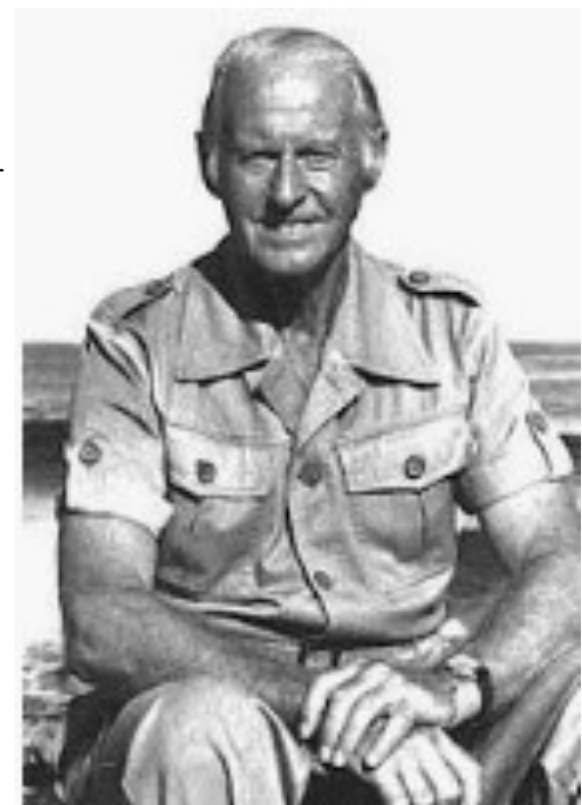
Adventurer Thor Heyerdahl