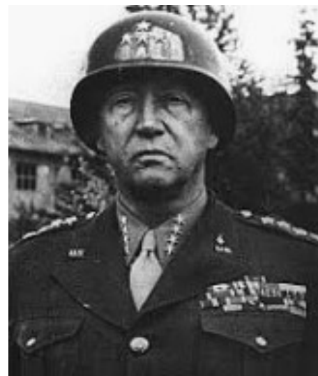
General George Patton