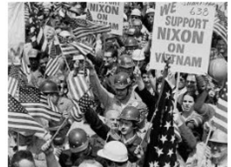
The Hard Hat Riot