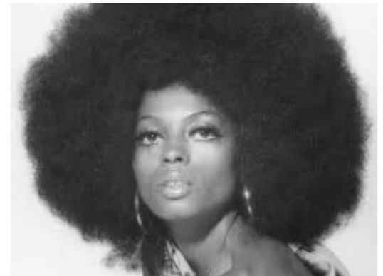
Diana Ross put Motown on the map