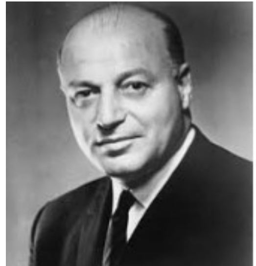
San Francisco Mayor Joseph Alioto