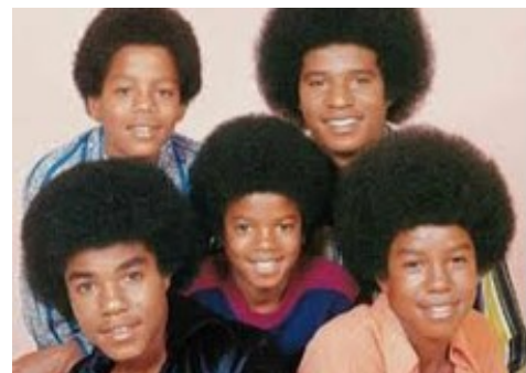
The Jackson Five