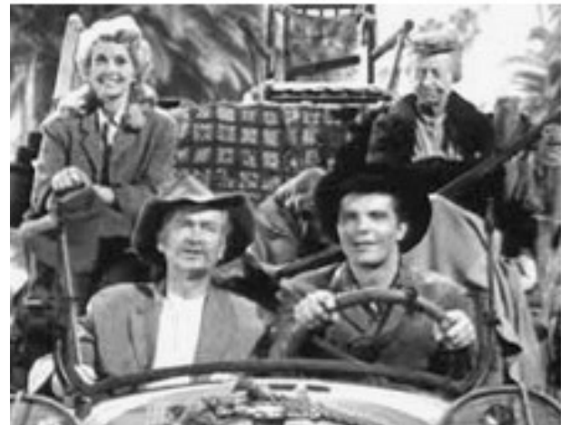
The Beverly Hillbillies keep it real in tinseltown