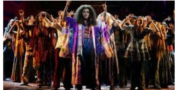
Hair rules Broadway