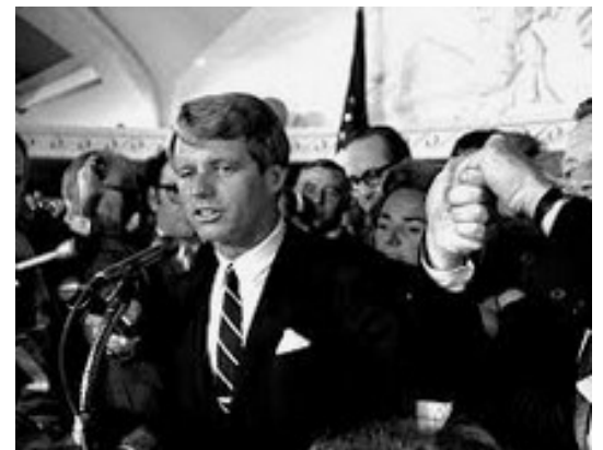
Robert F Kennedy