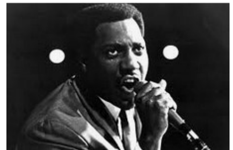
Otis Redding...gone too soon