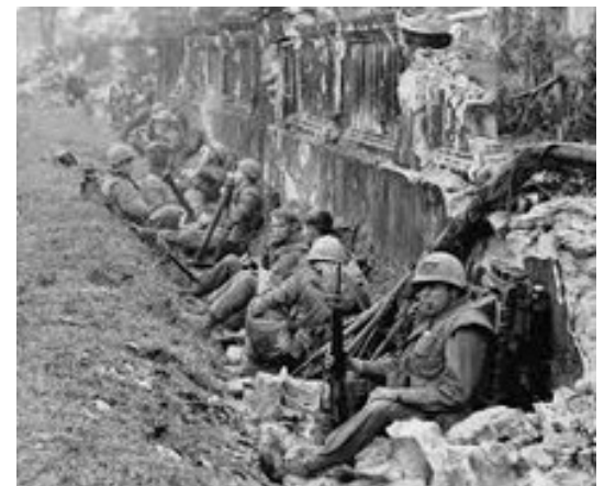
The Tet Offensive