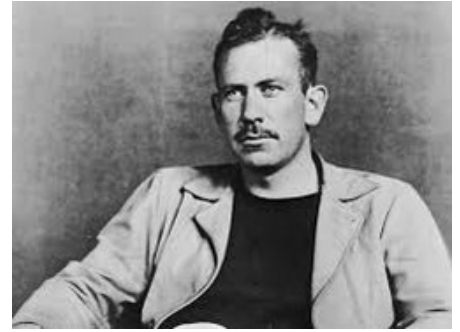
America's novelist John Steinbeck