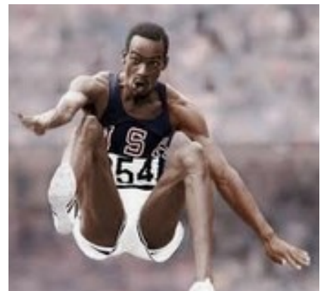
Bob Beamon flies